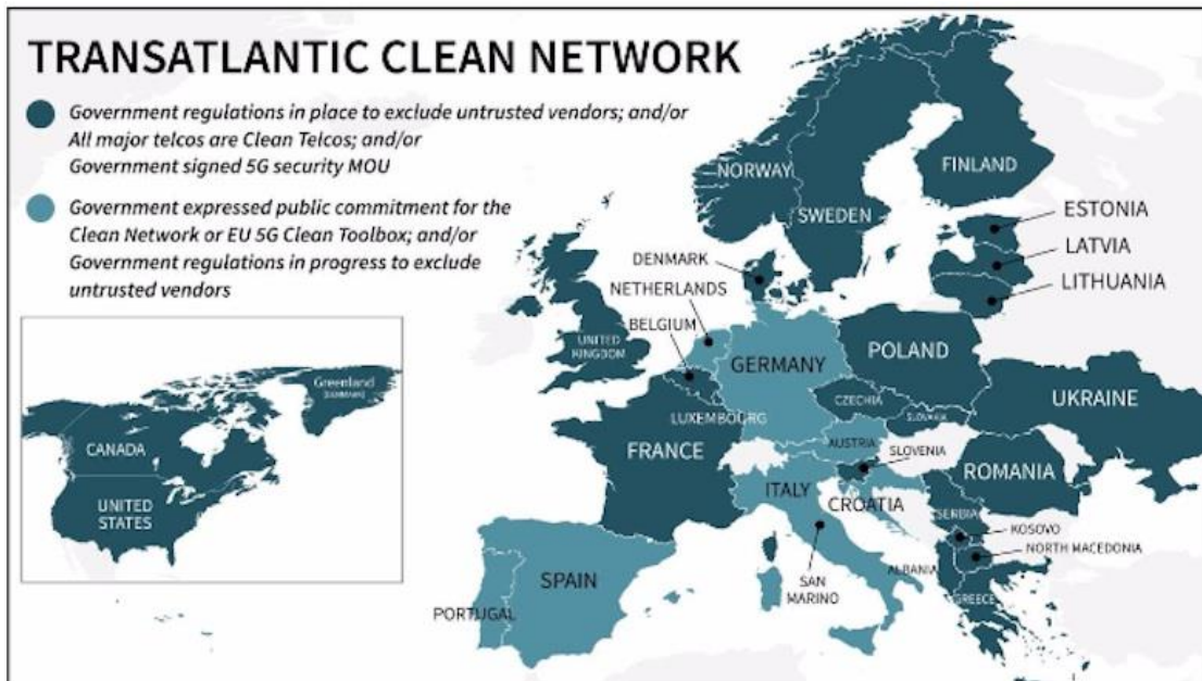
Figure 1: Member countries of Clean Network 10

Whether the network hardware and software suppliers are subject, without independent judicial review, to control by a foreign government . [emphasis added] 9